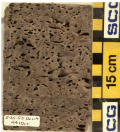
5-25-53-26W4 NISKU FORMATION Amphipora Floatstone